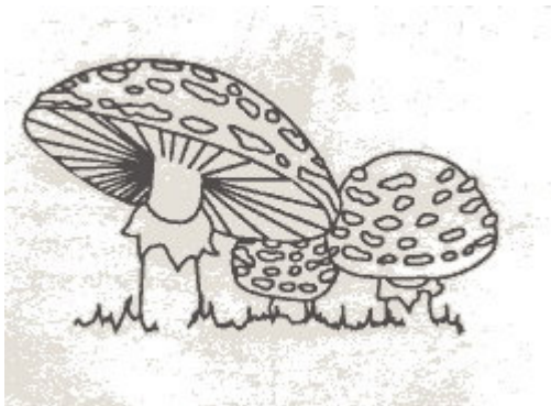
1983-1993 Sporadic News