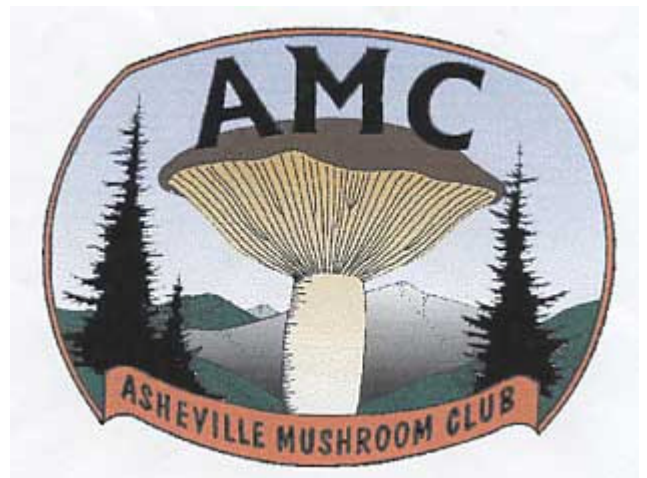
1993 original color